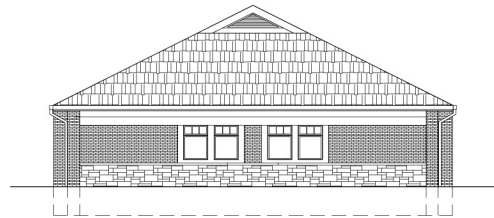
ELEVATION NORTH / SOUTH SCALE: 1/8"=1'-0"